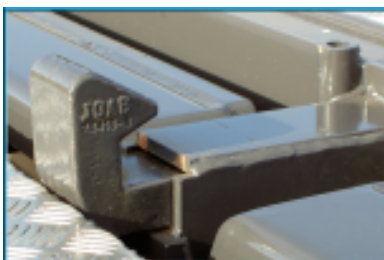
Hydraulic container lock