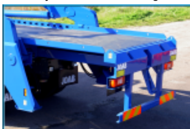
Extendable platform for 2 containers