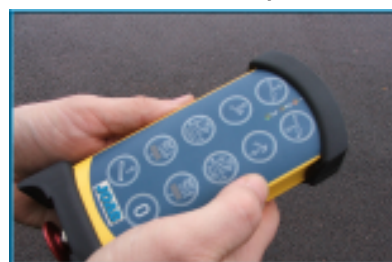
Radio remote control