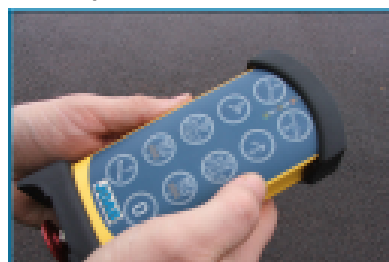
Radio remote control