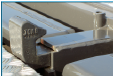
Hydraulic container lock