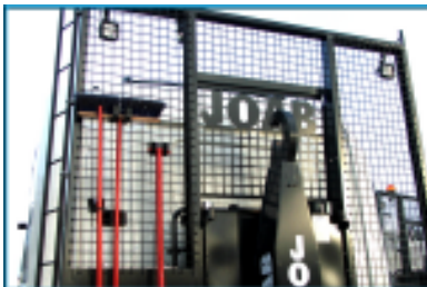
Impact tested head board