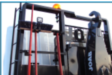
Tank, valve and tool brackets