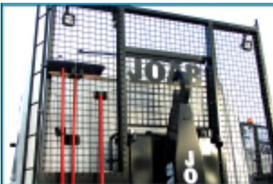
Impact tested head board