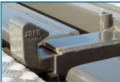
Hydraulic container lock